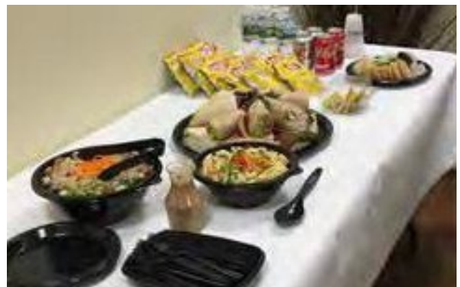
Luncheon Set-Up: Disposable Trays

All prices are subject to change without notice. Prices are subject to a staffing fee, state & meal taxes.