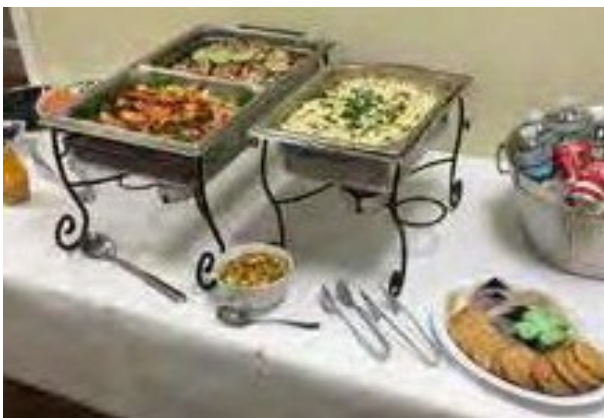
Executive Set-Up: Chafers, Silver & Ceramic Trays Requires additional pick up

Delivery rates may vary by location and order details. Additional fees will apply for off-hour deliveries or pick-ups.