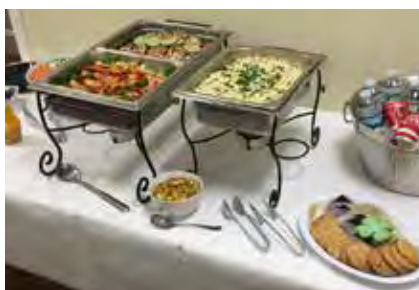
Executive Set-Up - Chafers, Silver or Ceramic Trays

Service Staff is available at varying rates per person, per hour. Our minimum service for all events that require staffing is two (2) staff members for four (4) hours, regardless of the event. Travel time is added on to the events.